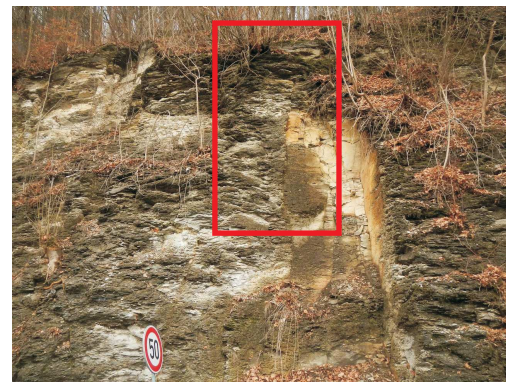
stan. 239 - 244m