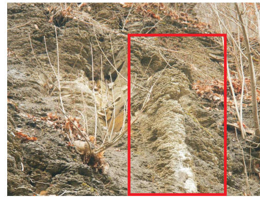
stan. 307 - 312m