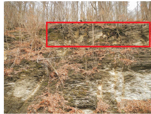
stan. 249 - 254m