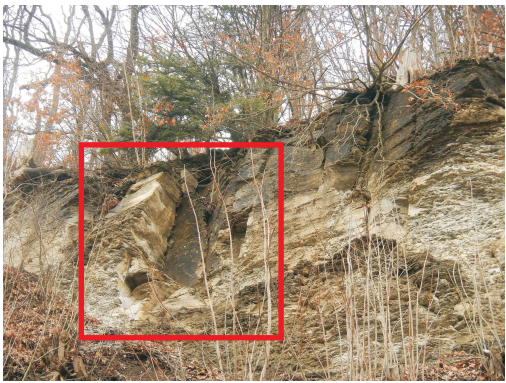
stan. 275 - 279m