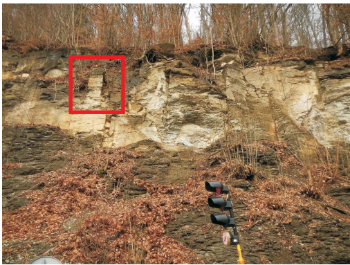
stan. 212 - 219m