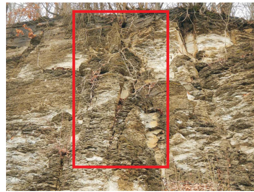
stan. 297 - 301m